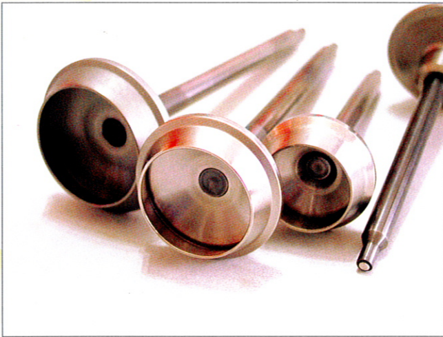
ROTORS FOR SE7.SE8.SE9.SE10