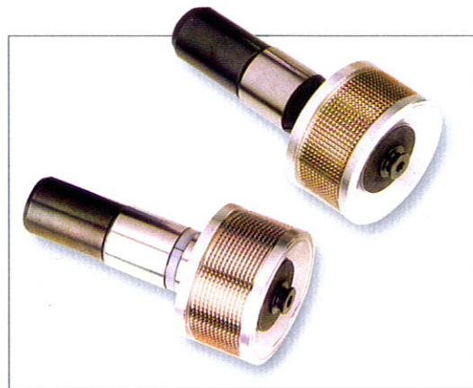
OPENING ROLLER COMPLETE WITH BEARING AND SOLID RING SE7.SE8.SE9.SE10