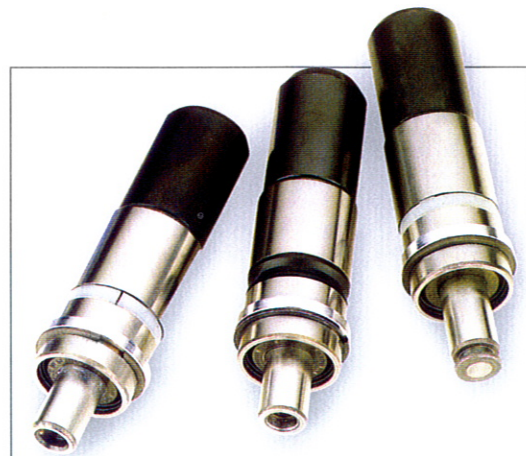
BEARINGS FOR OPENING ROLLERS TYPE SE7.SE8.SE9